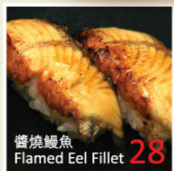
醬燒鰻魚 Flamed Eel Fillet 28