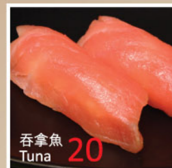
吞拿魚 Tuna 20