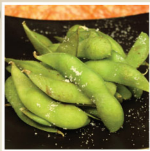
岩鹽枝豆 Boiled Japanese Green Beans, Seasoned with Natural Rock Salt 25