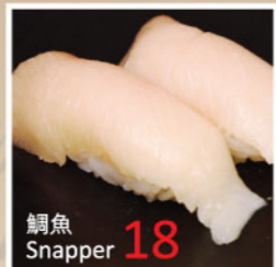
鯛魚 Snapper 18