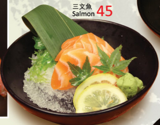
三文魚 Salmon 45