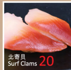
北寄貝 Surf Clams 20