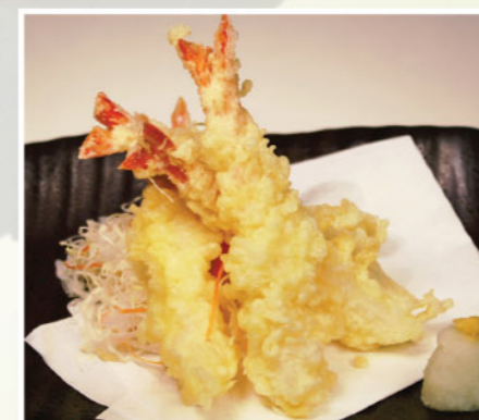
大蝦天婦羅 Shrimp Tempura 48