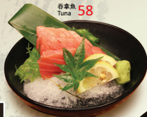
吞拿魚 Tuna 58