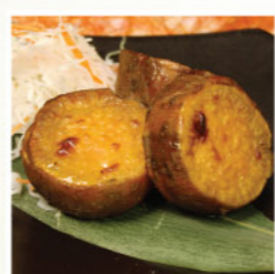
甘燒蕃薯 Roasted Sweet Potatoes 16