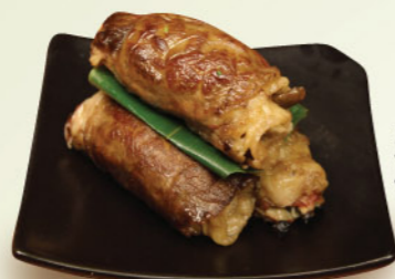
和牛雜菜卷 Wagyu Beef and Vegetable Roulades 22