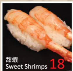
甜蝦 Sweet Shrimps 18