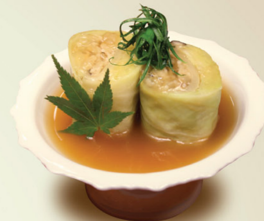
黑松露菌清酒椰菜卷 Truffled Cabbage Rolls in Sake Bouillon 38