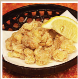
脆炸雞軟骨 Deep-Fried Chicken Cartilage 35