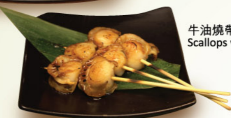
牛油燒帶子串 Scallops with Butter 22