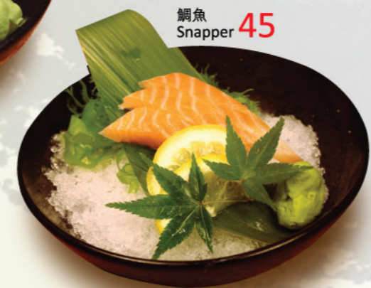
鯛魚 Snapper 45