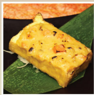
燒海膽豆腐 Grilled Bean Curd and Sea Urchin 28