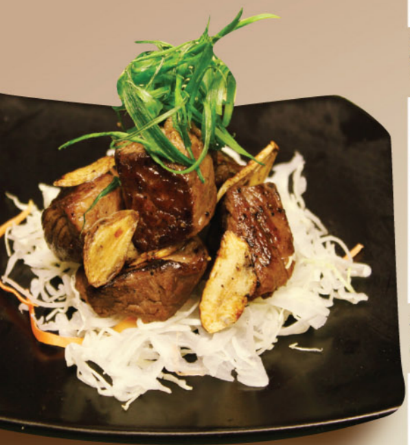
香蒜鐵板燒牛柳粒 Teppanyaki Beef Cubes with Garlic 52