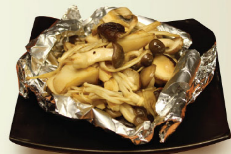
牛油焗松茸野菌 Butter-Baked Matsutake and Wild Mushrooms in Aluminum Foil 38