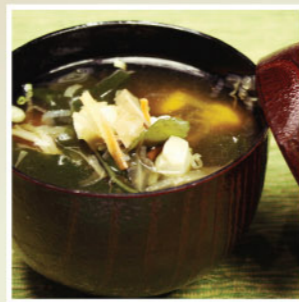
鰹魚野菜清湯 Katsuo Vegetable Clear Broth 20