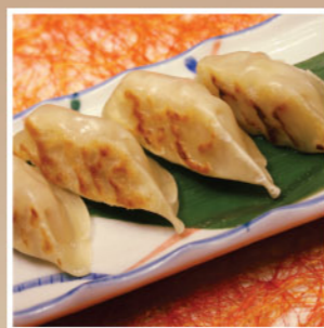
鐵板燒日式餃子 Teppanyaki Japanese Dumplings 38