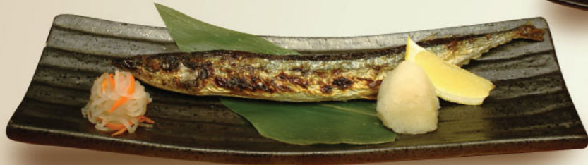
岩鹽燒秋刀魚 Roasted Pacific Saury with Natural Rock Salt 25