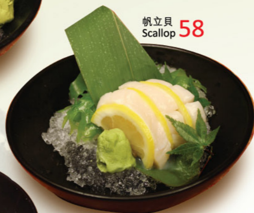
帆立貝 Scallop 58