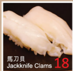
馬刀貝 Jackknife Clams 18