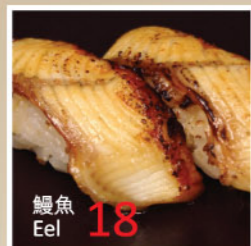
鰻魚 Eel 18