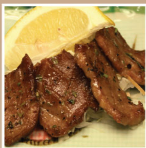
海苔燒牛舌 Grilled Ox Tongue with Nori 48