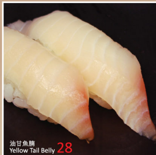
油甘魚腩 Yellow Tail Belly 28