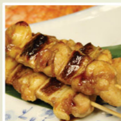
大蔥雞肉串 Leek and Chicken Meat 18