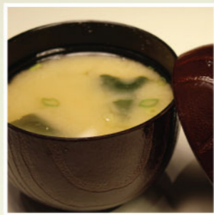
味噌湯 Miso Soup 18