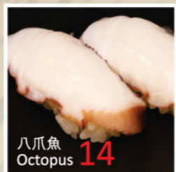
八爪魚 Octopus 14