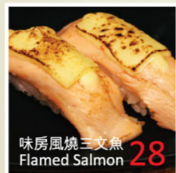
味房風燒三文魚 Flamed Salmon 28