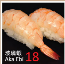
玻璃蝦 Aka Ebi 18