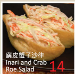
腐皮蟹子沙律 Inari and Crab Roe Salad 14