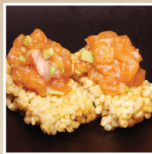
三文魚牛油果他他 Fresh Salmon and Avocado Tartar 28