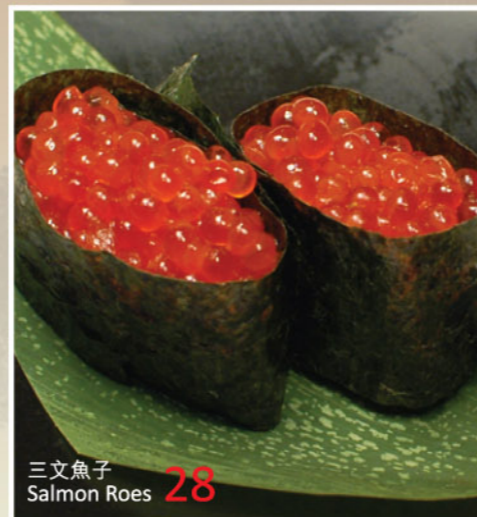
三文魚子 Salmon Roes 28