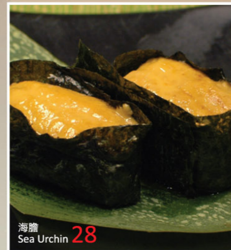
海膽 Sea Urchin 28