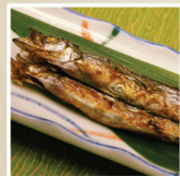
岩鹽燒多春魚 Roasted Shishamo with Natural Rock Salt 20