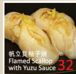
帆立貝柚子燒 Flamed Scallop with Yuzu Sauce 32