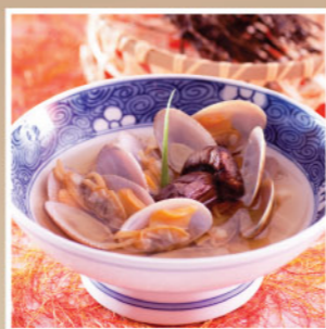
松茸清酒煮花甲 Matsutake Mushrooms and Asari Clams in Sake Broth 35