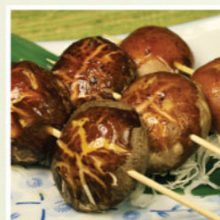
鮮冬菇田樂燒 Fresh Shiitake Mushrooms 16