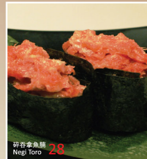
碎吞拿魚腩 Negi Toro 28