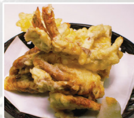
軟殼蟹天婦羅 Soft Shell Crab Tempura 48