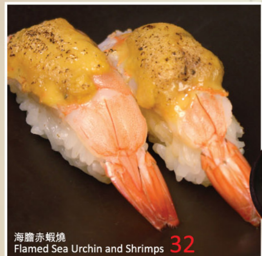
海膽赤蝦燒 Flamed Sea Urchin and Shrimps 32