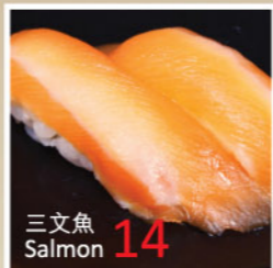
三文魚 Salmon 14